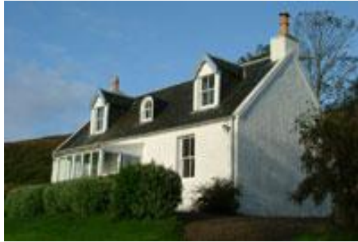
Plan of Oran na Mara (not to scale)

Rate Band C ~ Saturday Arrival 2 Bedrooms ~ Sleeps 5/6 1 Double bed ~ 2 Single beds ~ Double Sofa Bed Linen & Towel Service No Dogs & No Smoking STB Grading ~ 3 Stars