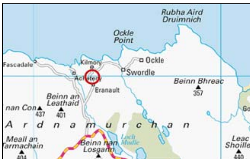
Ceol na Mara, Branault, Achateny, Acharacle, Highland, PH36 4LG

From the Corran Ferry, the last 30 miles of road (from the outskirts of Strontian to Kilchoan) is single-track with many bends and consequentially slow. Coming off the ferry, turn left and head for Salen on the A861, and then turn left again, taking the B8007 to Kilchoan. Please try and leave yourself plenty of time for this part of the journey as it takes at least an hour and a half once you have crossed the Corran Ferry.